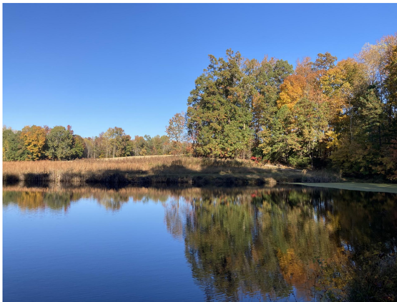
October Reflections on Bluestem's Pond

We come together as volunteers to love this land and this place. To help create the dream of Bluestem with our loving fingers planting seeds in soil, digging graves for beloveds, arms holding onto one another in our grief. Birds call, the cows in the neighboring fields moo. Tears are shed on the earth and laughter reverberates through the trees. Someone asks, "is this really a cemetery?" The answer is yes -- a place of reverence for the past and the future, where we honor precious life and endings with loved ones both near and gone. Welcome to Bluestem.