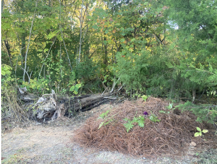
Woodland gravesite at Bluestem

Bluestem is open for immediate need burial. Contact Jeff or Heidi to make arrangements.