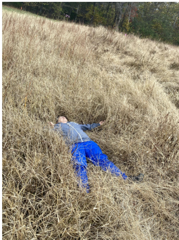
A beloved volunteer finding her place amidst the Little Bluestem