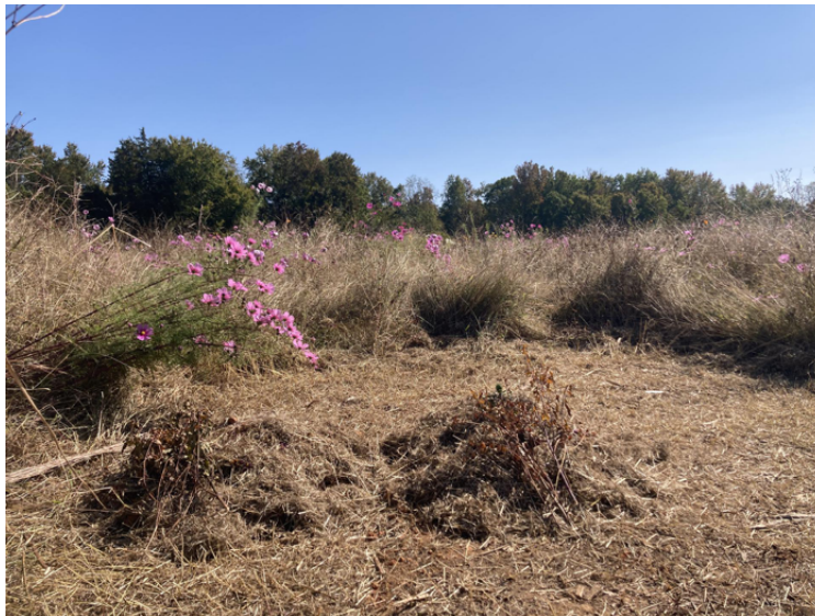
Burial of ashes in the grasslands