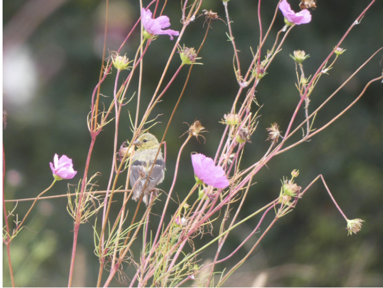
An American Goldfinch alights in the grasslands