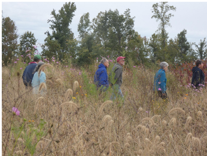
Friends walking in the grasslands

We come together as volunteers to love this land and this place. To help create the dream of Bluestem with our loving fingers planting seeds in soil, digging graves for beloveds, arms holding onto one another in our grief. Birds call, the cows in the neighboring fields moo. Tears are shed on the earth and laughter reverberates through the trees. Someone asks, "is this really a cemetery?" The answer is yes -- a place of reverence for the past and the future, where we honor precious life and endings with loved ones both near and gone. Welcome to Bluestem.