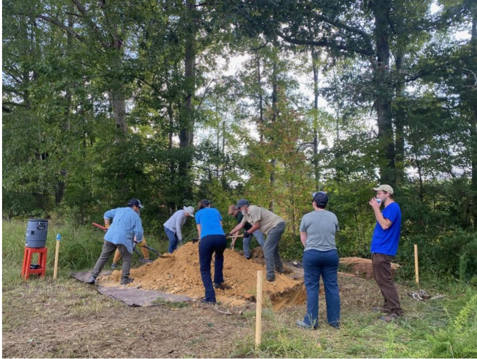
Burial crew training for new volunteers.