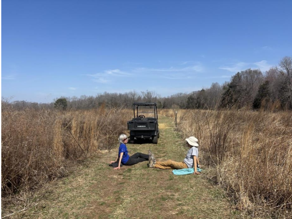
Taking a break from invasives removal!