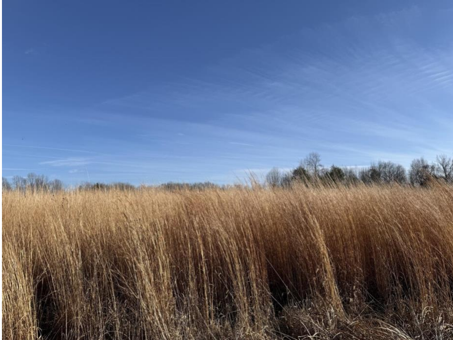
Bluestem grasses store carbon below ground.