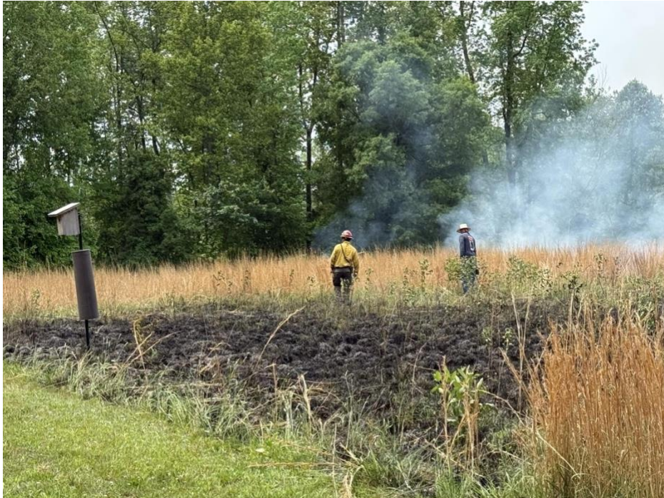
Last year's controlled burn moving across a portion of First Field.

A special welcome to new Bluestem Families who are receiving this newsletter for the first time. We are so grateful for your loved one's decision to become a part of this place. Their legacy supports the perpetual care and protection of this living, generative landscape where pollinators, wildlife, and people can find refuge. We hope you gain comfort from Bluestem and from the community that cares for it.