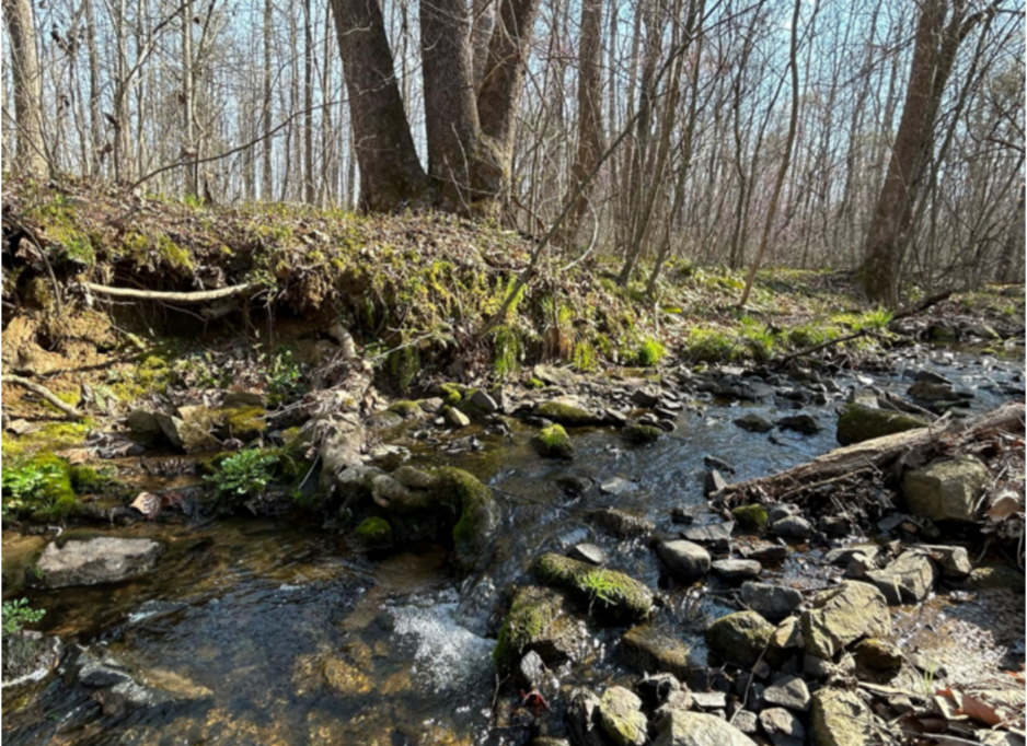
Future hiking trail beside the creek