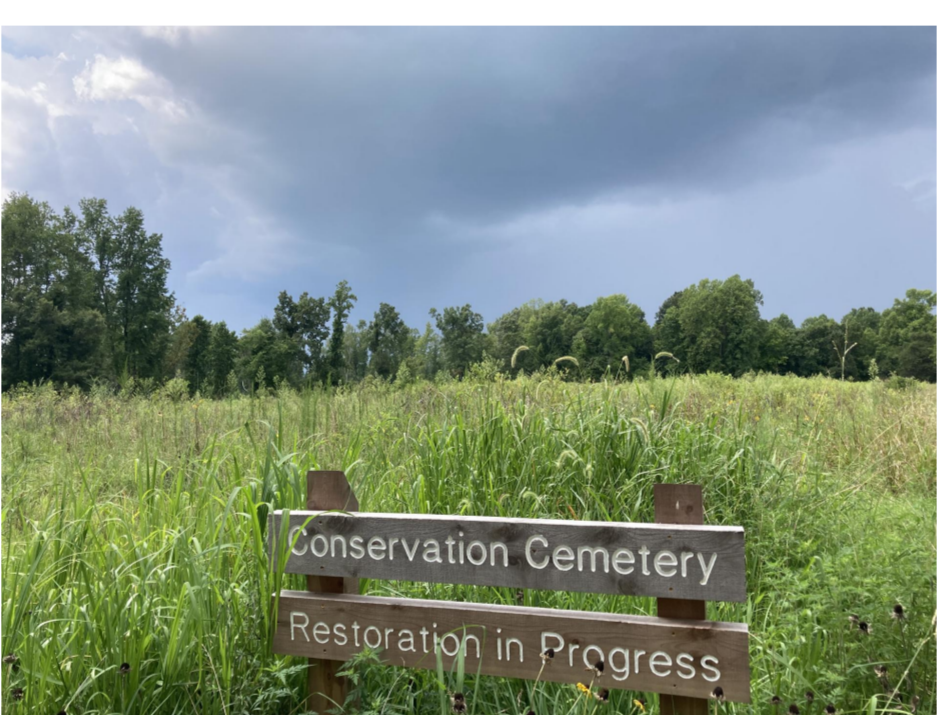
Entrance to the cemetery