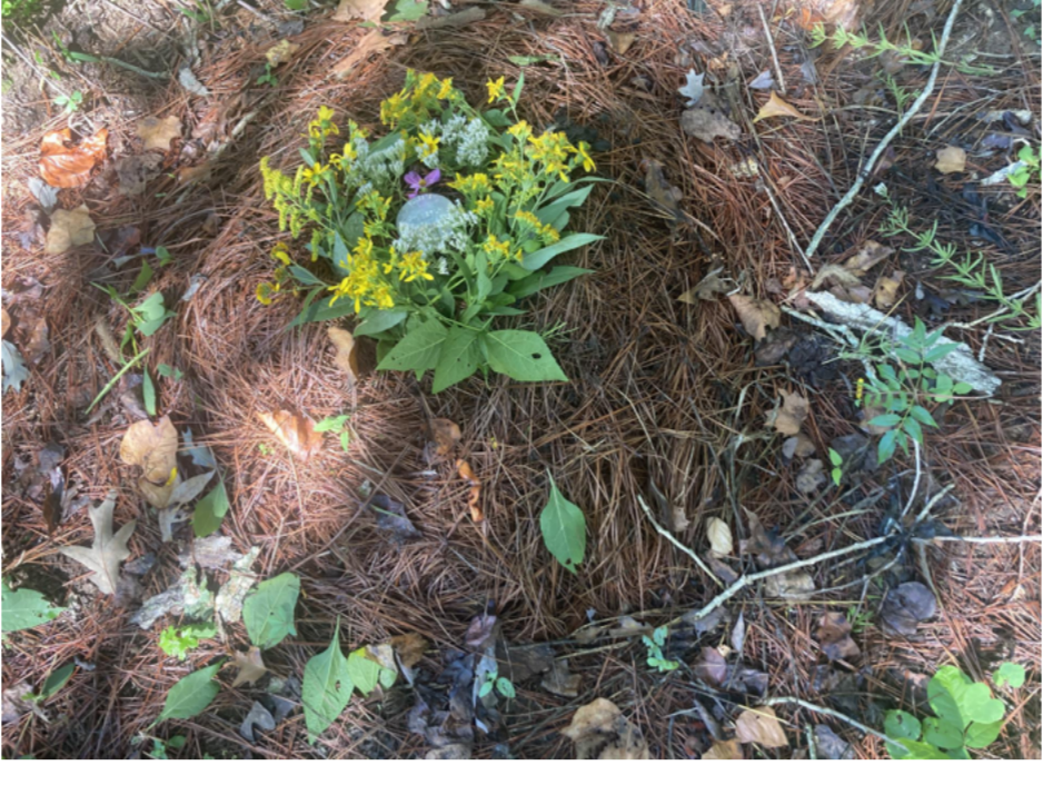
Ash gravesite in the Woodlands