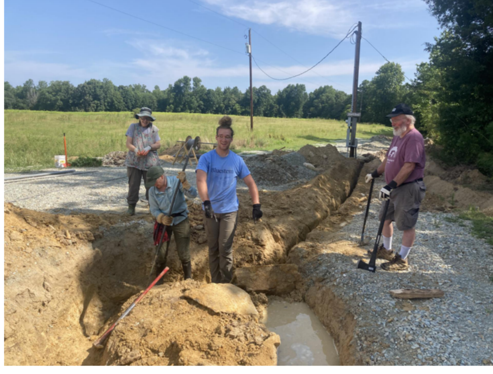
Hardworking volunteers trenching for water at Bluestem