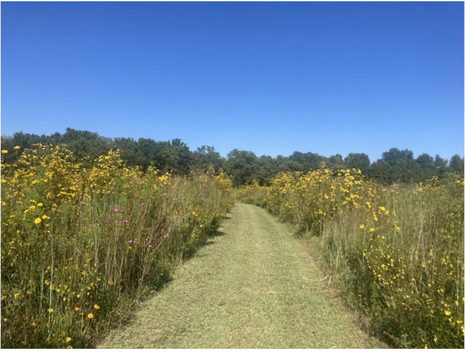
Pathways in the grasslands